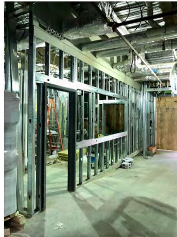
Interior framing at 1 st floor Cafeteria and Lobby Academic Building.