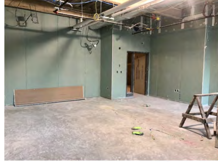
Installation of sheetrock at 2nd floor corridor and classrooms Academic Building.