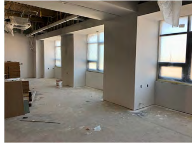
Priming walls at 4 th floor classrooms Academic Building.