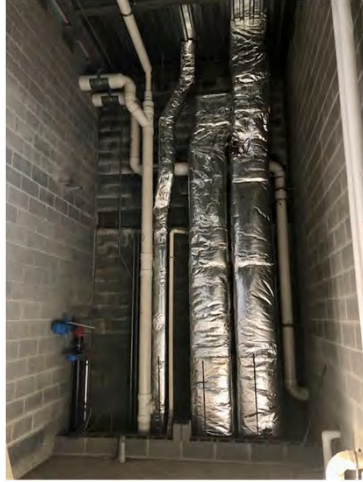
Installation of ductwork and piping at Community Building