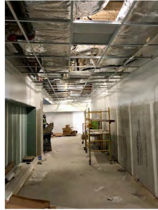
Installation of ceiling grid at 4 th floor classrooms & corridors Academic Building.