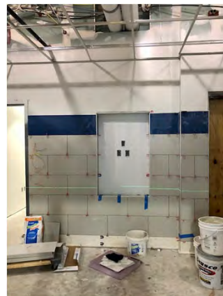
Installation of terrazzo base and wall tile at 4 th floor corridors Academic Building.