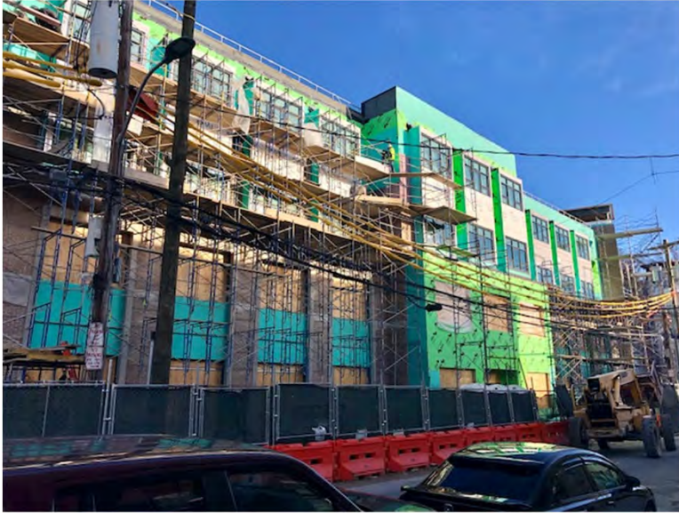
View of Academic Building looking Northeast.