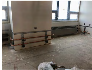
Installation of fin tube radiation & covers at 4 th floor classrooms Academic Building.