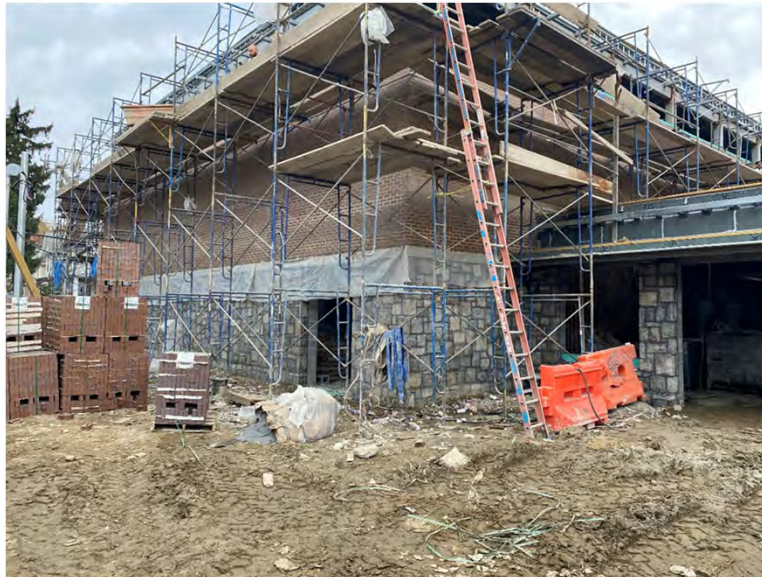
Installation of brick veneer at Community Building.