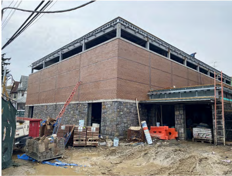
Completed stone and brick veneer at Community Building.