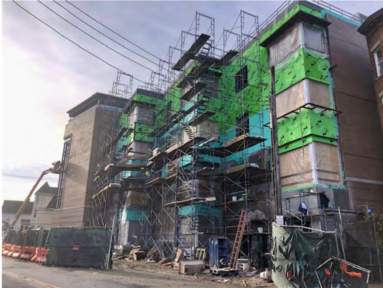
View of Academic Building looking Southwest.