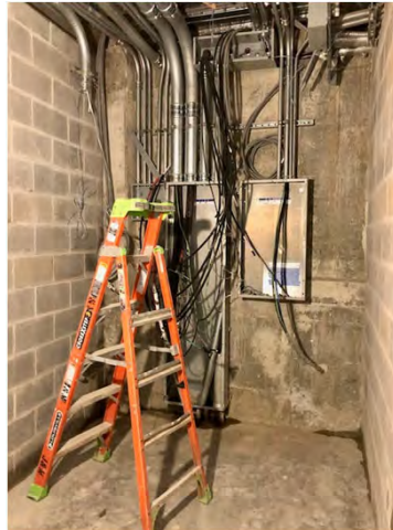
Installation of sprinkler piping and electrical feeders at Community Building.