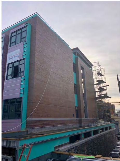
View of Academic Building looking from the Community Building.