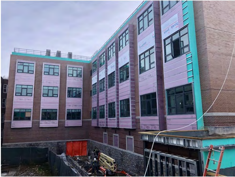
View of Academic Building from the courtyard.