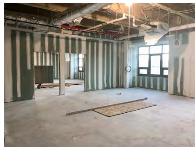
Taping walls at 3rd floor classrooms Academic Building.